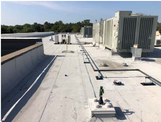
Gas piping on WPA Roof