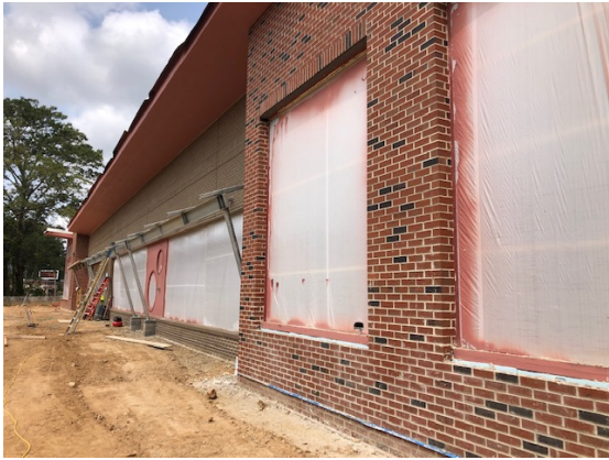
South Elevation at the YMCA