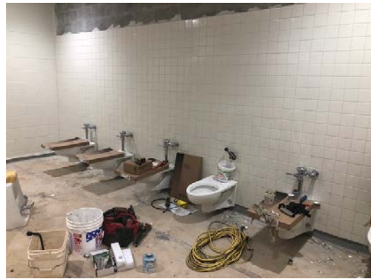
LL Gang bathroom tile at WPA