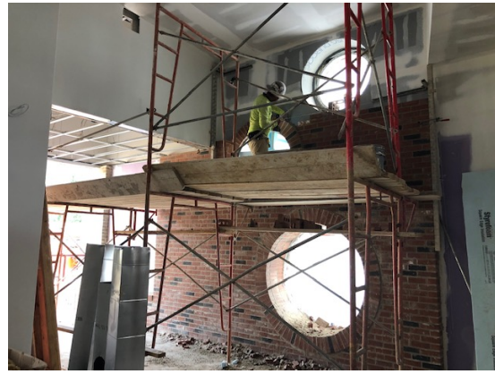
Interior Brick at circular Windows