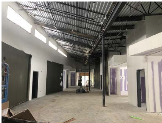
Commons area at YMCA